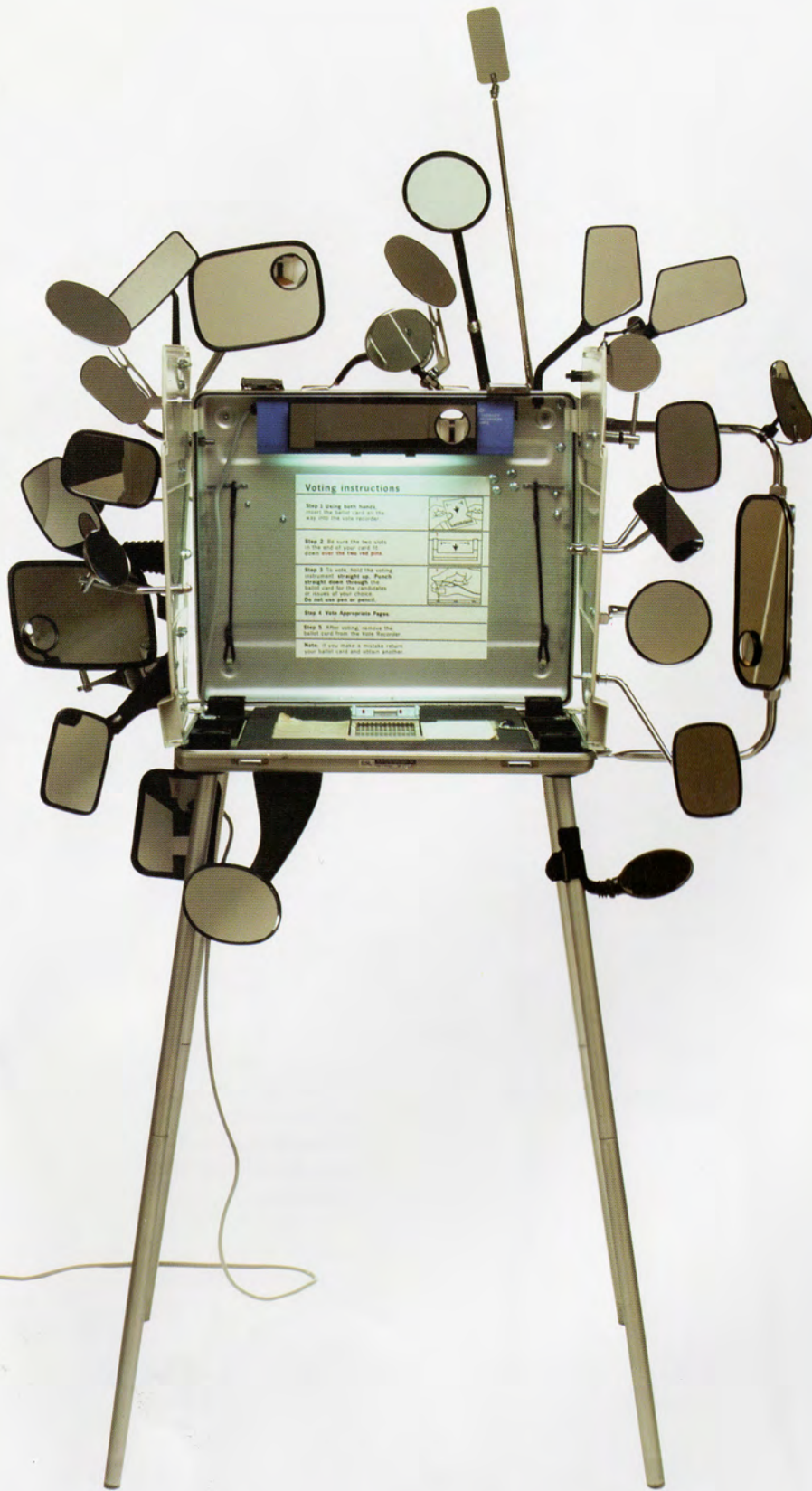
(LEFT) ROBERT A.M. STERN ARCHITECTS HINDSIGHT 20/20