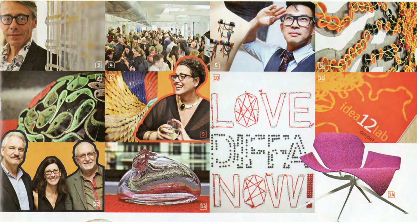
1. Situ Studio's Volumetric Carpet Tiles .